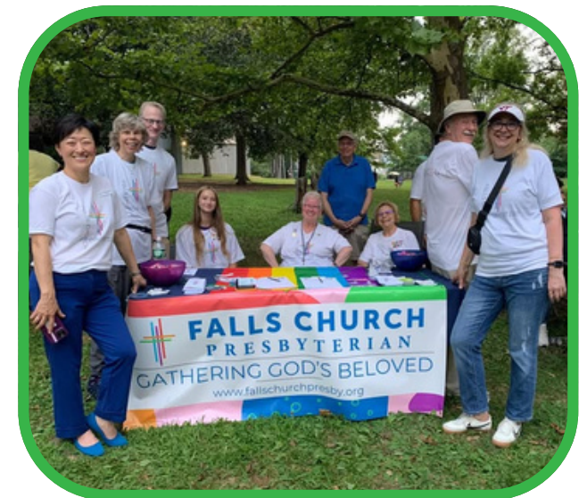
National Night Out, Cherry Hill Park

We also connect with the wider community by hosting the Halloween Trunk or Treat, participating in National Night Out in Cherry Hill Park, and taking part in the Falls Church Festival & Taste of Falls Church. We look forward to supporting the fourth season of the Crooked Steeple Literary Festival. Week in and week out, Community Building works to build faith through community—all for the joy of it.