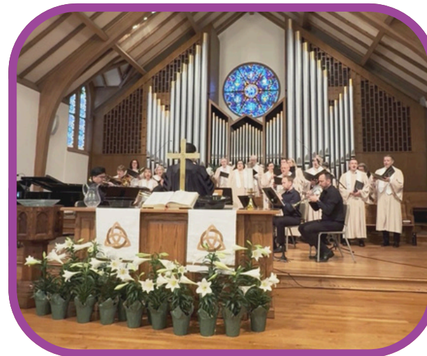
Chancel Choir, Easter Worship Service

With energy, love, and purpose, we gather each week to be renewed and sent into the world.