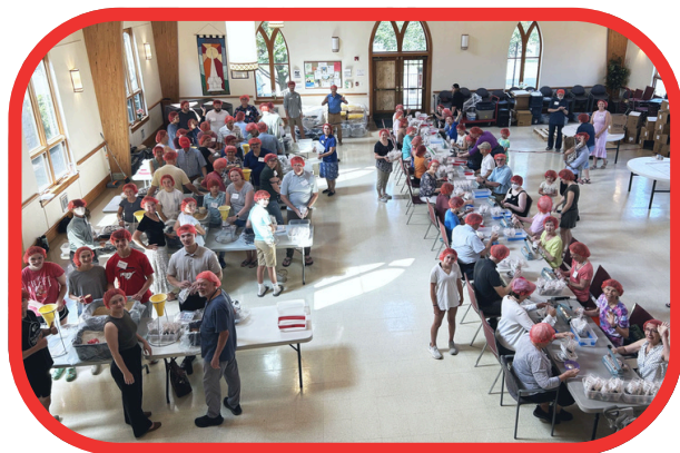
Rise Against Hunger

Each of these efforts reflects not timidity, but a Spirit-filled commitment to love, serve, and give—faithfully, generously, and with purpose.