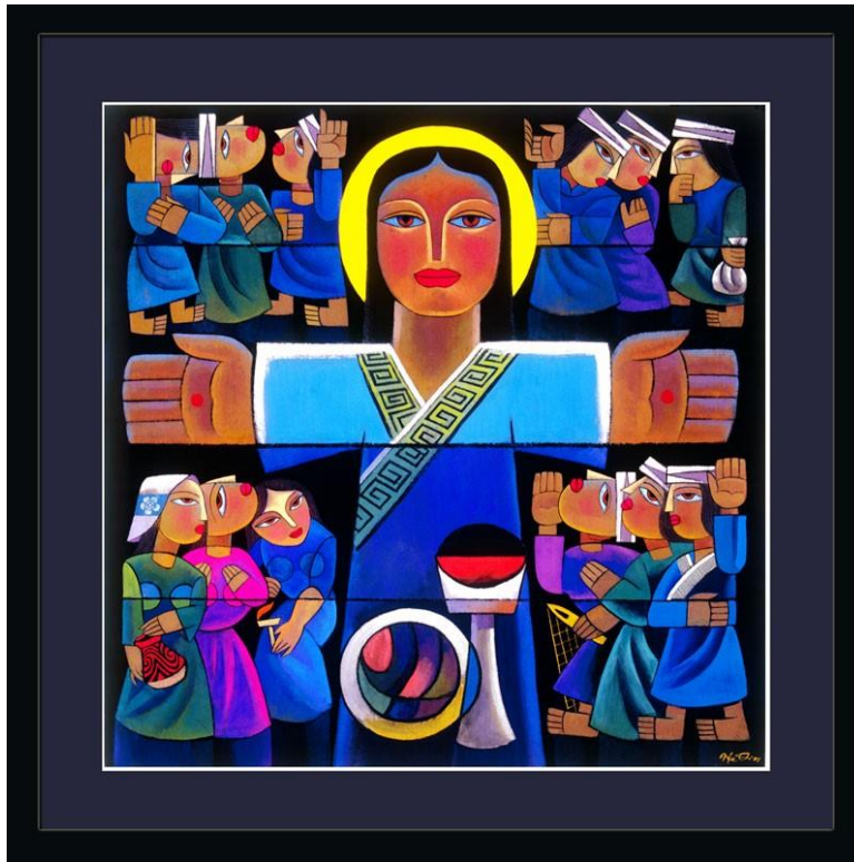
"The Risen Lord" by He Qi

Gathering those who fear they are not enough, so we may experience grace, wholeness, and renewal as God's beloved.