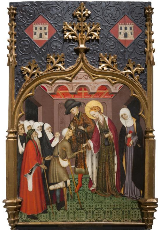
St. Lucy giving alms, Bernat Martorell, c. 1435 The Museu Nacional d'Art de Catalunya, Barcelona