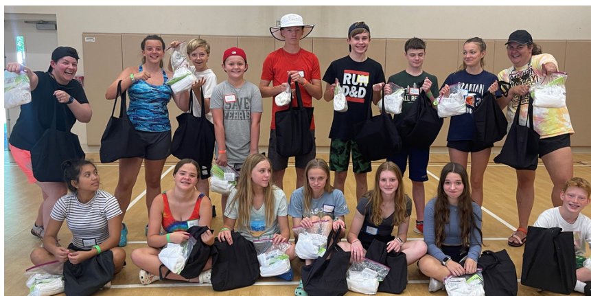
FCPC and Providence Presbyterian youth join forces on Mission Monday to pack 100 school kits and 120 hygiene kits for Presbyterian Disaster Assistance. Prepping kits in advance allows PDA to respond when the need arises.