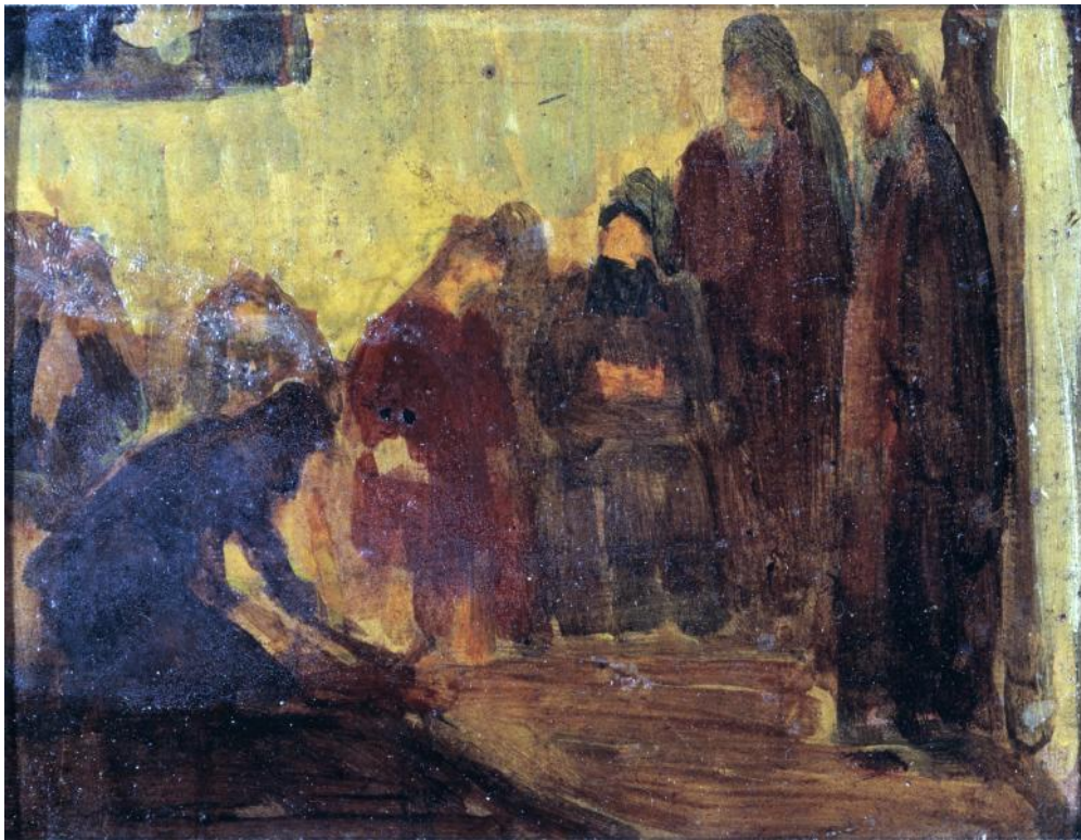
Study, Christ Washing the Feet of the Disciples, Henry Ossawa Tanner, ca. 1905

Gathering those who fear they are not enough, so we may experience grace, wholeness, and renewal as God's beloved.