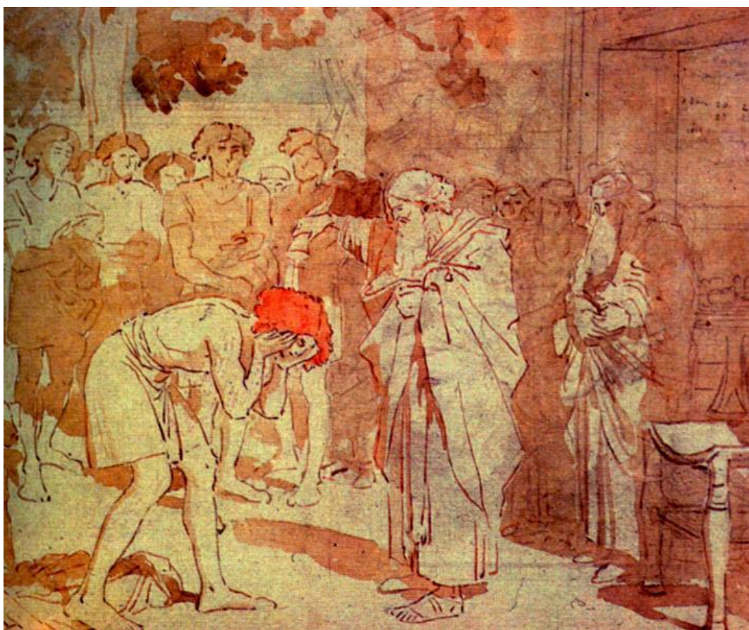
Samuel Anoints David to the Kingdom, Alexander Ivanov, 1806-1858

Gathering those who fear they are not enough, so we may experience grace, wholeness, and renewal as God's beloved.